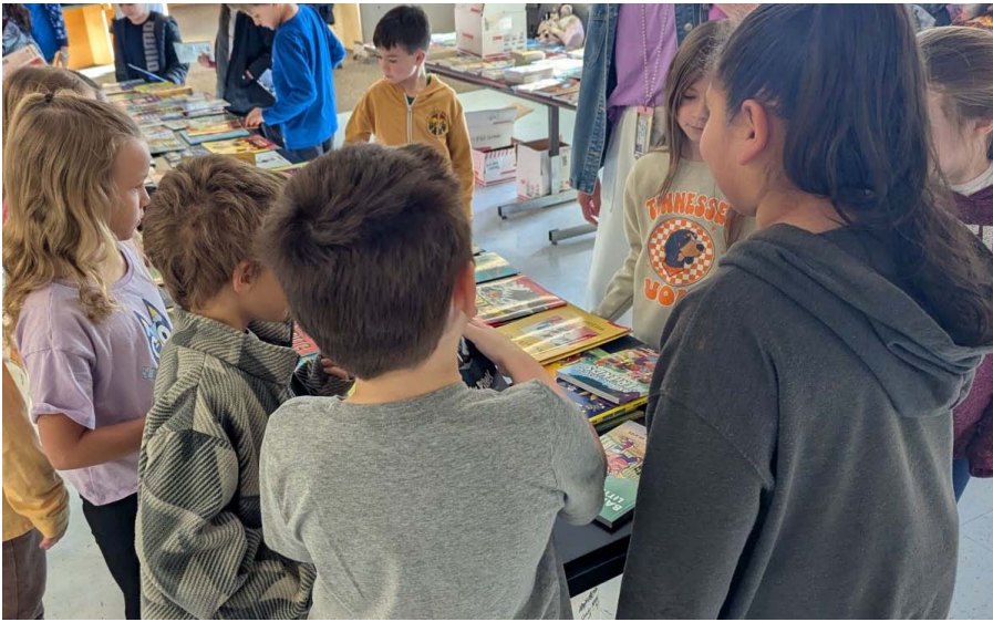
Polk Central Elementary School students select books.